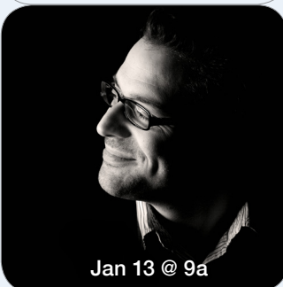
Jan 13 @ 9a