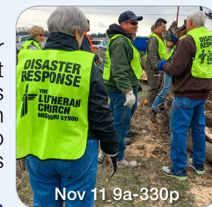
Nov 11 9a-330p