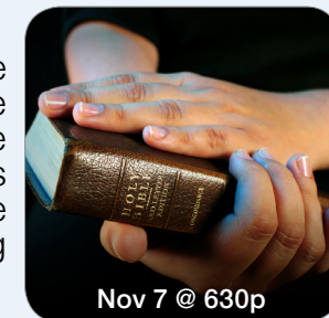
Nov 7 @ 630p

The B & B Group Bible Study meets in the administration conference room generally on the first and third Tuesday each month at 630p. Come join a fun-loving group of people for hearty laughs as they study "The life and letters of the Apostle Peter". For more info contact Office@CTKLM.org or call 727-595-2117.