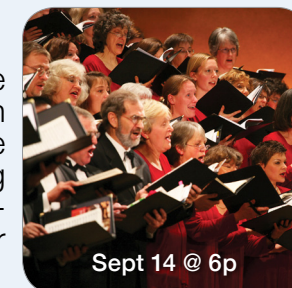
Sept 14 @ 6p

Are you always humming a tune or singing in the shower? This is a perfect time to connect with other singers and join the choir at CTK. Come one, come all to choir rehearsal starting September 14 @ 6p. Contact Colleen at 727-460-9646 or email Colleen@CTKLM.org for more information.