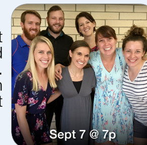
Sept 7 @ 7p