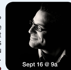
Sept 16 @ 9a