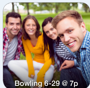
Bowling 6-29 @ 7p