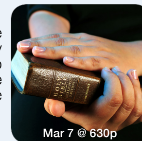
Mar 7 @ 630p