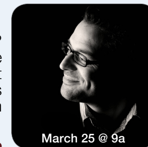
March 25 @ 9a