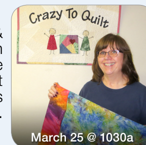
March 25 @ 1030a

Join us for the 15th annual Quilters' Luncheon & Auction, a fundraiser for the Christian Outreach Center (COC). There will be a drawing and a large variety of quilts and wall hangings to complement this year's "Changing Seasons" theme. Tickets are $15 and include lunch. Sat, Mar 25 at 1030a. For tickets contact the office at 727-595-2117.