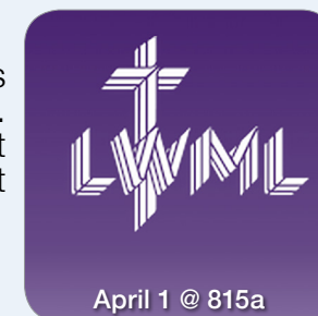
April 1 @ 815a